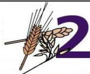
2 Cereals containing gluten